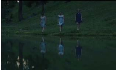
Reines d'un jour (Queens for a day)

REINES D'UN JOUR , Switzerland, 26 minutes