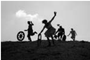
Car Men | Thomas Kusa

A man and a woman, who take no notice of each other, search for shelter in a desolate forest. While the rain pours down, intimacy ignites between them. The leaking roofing doesn't bother them, on the contrary: the augmenting torrent of raindrops inspires their intimate dance. When the rain stops, the magic dissolves; they both leave, feeling uneasy and ashamed.